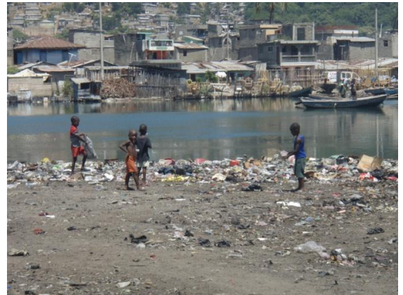
Children playing on trash in Cap-Haitien

Pinnacle Healthcare Consortium (PHC) is familiar with the challenges faced in providing infrastructure improvement programs in developing countries. Our first step will be to construct a Stakeholder Consultation Statement in order to seek the appropriate balance of ownership between the government, private and public stakeholders for these waste management initiatives.